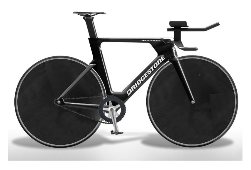
Bridgestone has developed new track bicycles that will be used in cycling events by Team Japan at the Olympic Games Tokyo 2020.

As the Official Bicycle of the Olympic and Paralympic Games Tokyo 2020, Bridgestone will supply more than 800 non-motorized bicycles to offer convenient and reliable mobility for Tokyo 2020 staff, volunteers, and athletes.