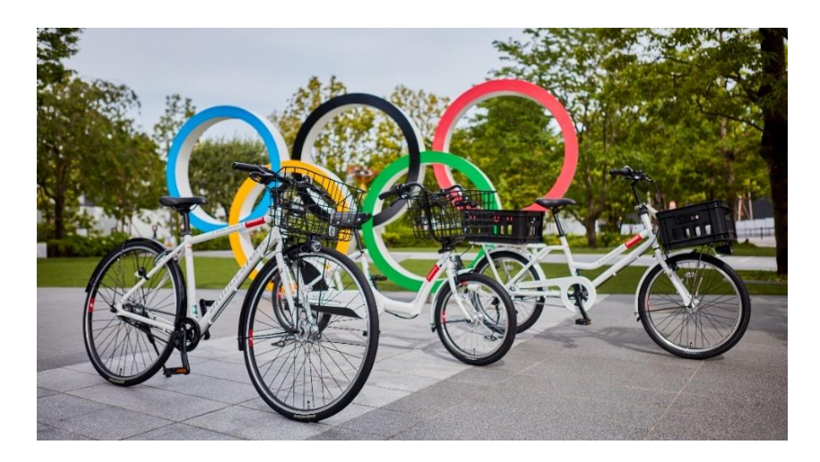
Bridgestone is providing a fleet of more than 800 non-motorized Bridgestone bicycles for Tokyo 2020.

As the Official Bicycle of the Olympic and Paralympic Games Tokyo 2020, Bridgestone will supply more than 800 non-motorized bicycles to offer convenient and reliable mobility for Tokyo 2020 staff, volunteers, and athletes.