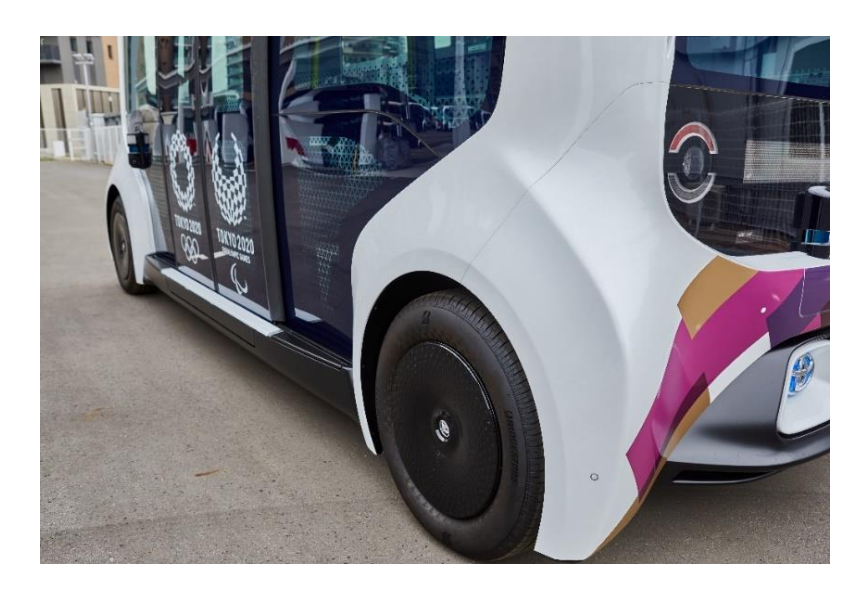
Bridgestone's support includes specially-designed tires for autonomous BEV Toyota e-Palette vehicles in the Olympic and Paralympic Villages.

As the Official Tire of the Olympic and Paralympic Games, Bridgestone will help keep the official IOC and IPC fleets in motion by providing high-performing tires and tire services for approximately 3,000 vehicles, including cars, competition support vehicles, unique concept vehicles that will help move staff, and more. Through a variety of solutions-based tire technologies and innovations, Bridgestone will support safe and efficient transportation at Tokyo 2020.